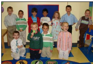
Happy Easter from Sunday School Class Kindergarten A